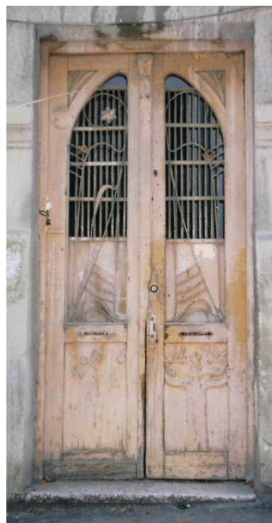
AN ENTRANCE BEFORE AND AFTER AN INSENSITIVE OVERHAUL, WHICH RESULTED IN THE LOSS OF SIGNIFICANT DETAIL.