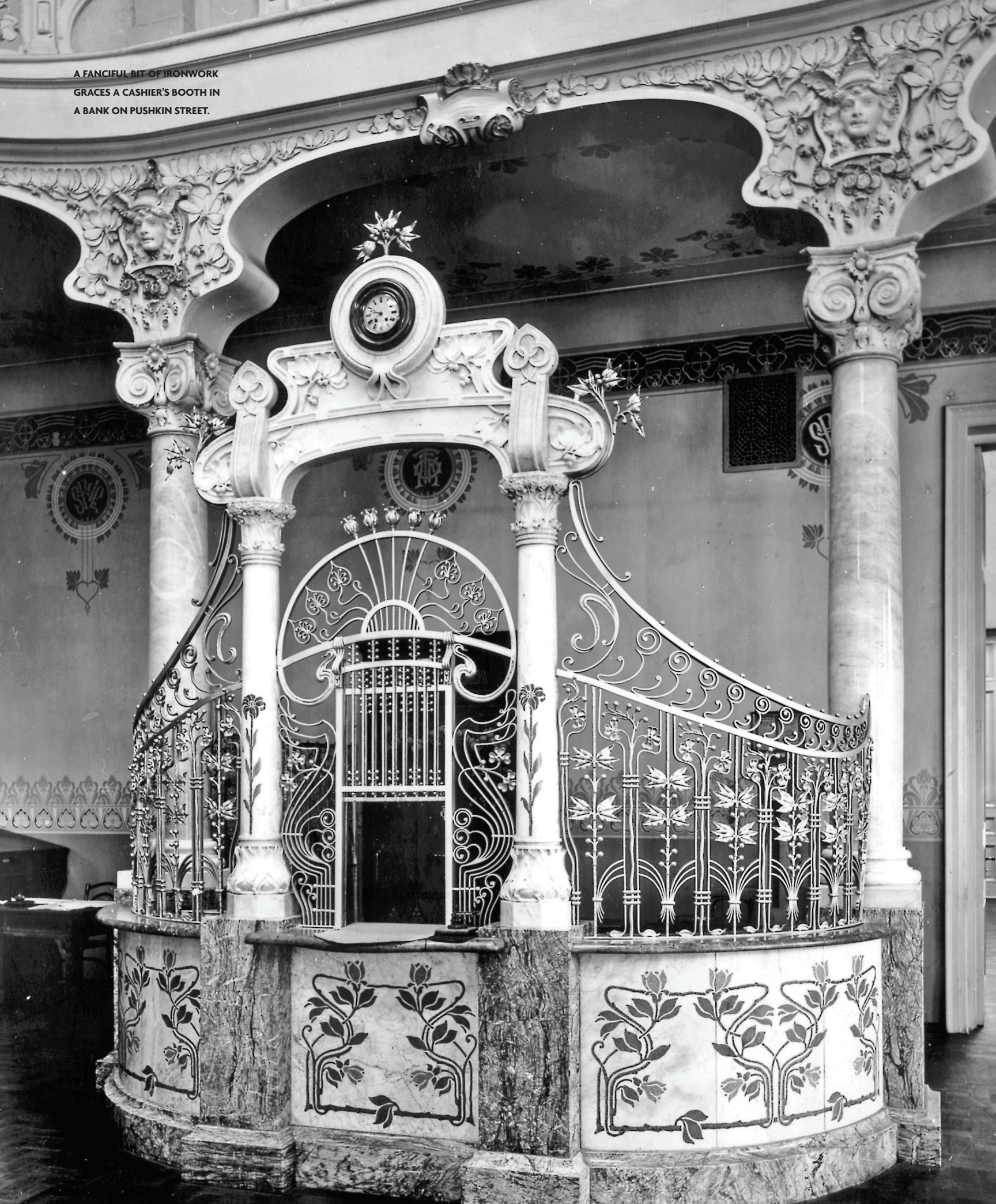
A FANCIFUL BIT OF IRONWORK GRACES A CASHIER'S BOOTH IN A BANK ON PUSHKIN STREET.