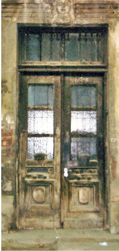
A DOORWAY AS IT APPEARED PRIOR TO RESTORATION IN 1997 AND FOLLOWING TREATMENT IN 2000