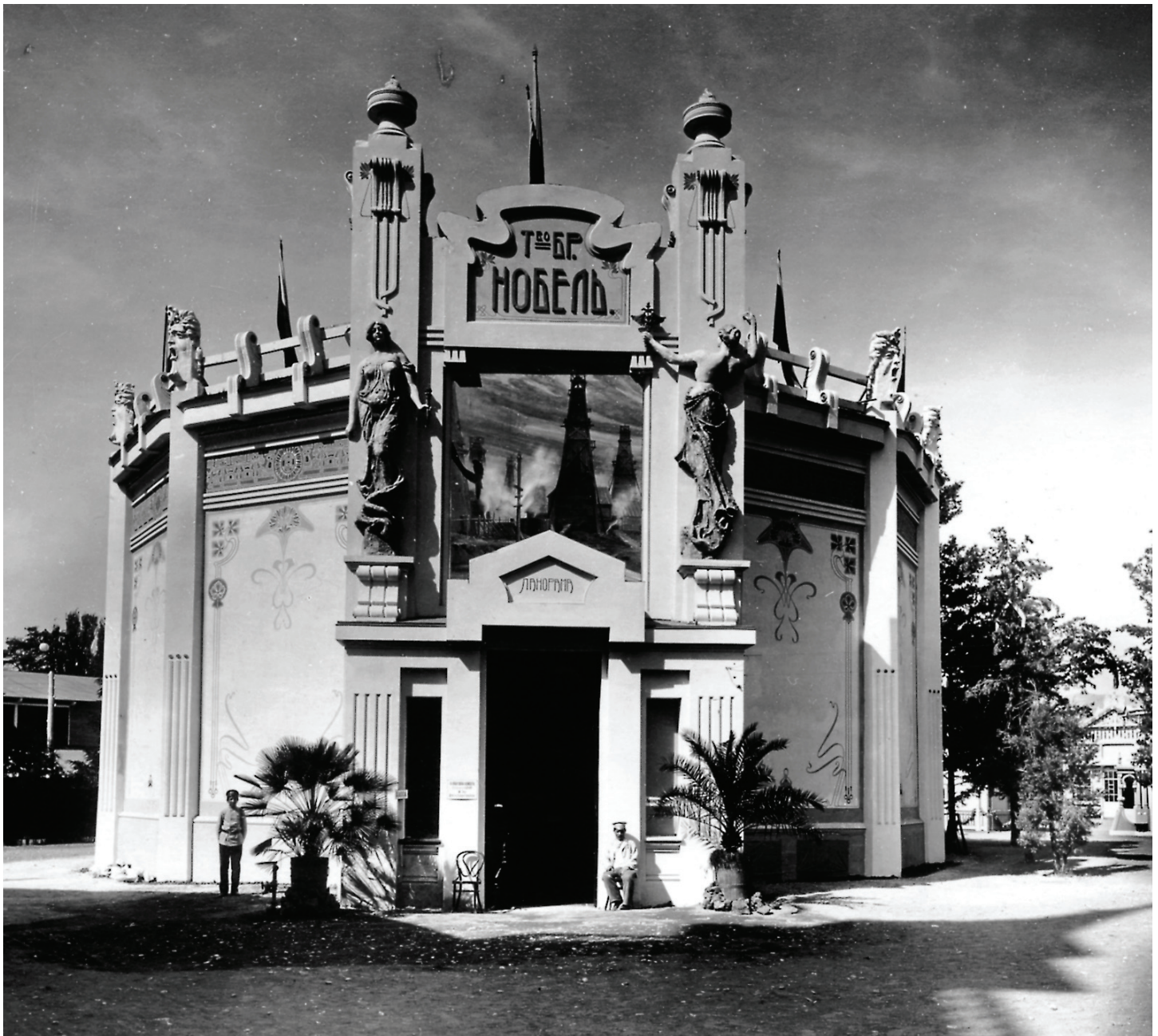
THE EXTRAORDINARY ART NOUVEAU FAÇADE OF THE 1901 NOBEL BROTHERS' PAVILION IN TBILISI IGNITED A FASCINATION WITH THE STYLE IN GEORGIA. SADLY, THE BUILDING NO LONGER STANDS

The classic curls and whiplash lines of the style sometimes mimic letters of their alphabet, but even more so bring to mind the endless stretches of grapevines that blanket the country. The stylized vegetation and nature scenes depicted in murals, stained glass, and mosaics that decorate the interior and exterior of the buildings held a great appeal with an urban population that still insisted on grand banquets held in the countryside.